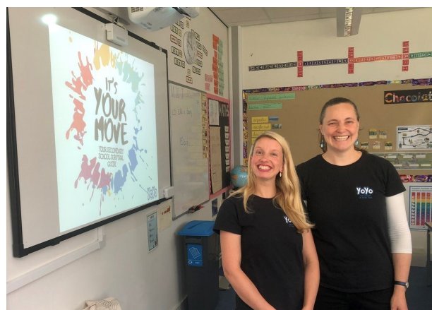
A couple from the YoYo team getting ready for an assembly in one of their schools

https://content.scriptureunion.org.uk/its-your-move